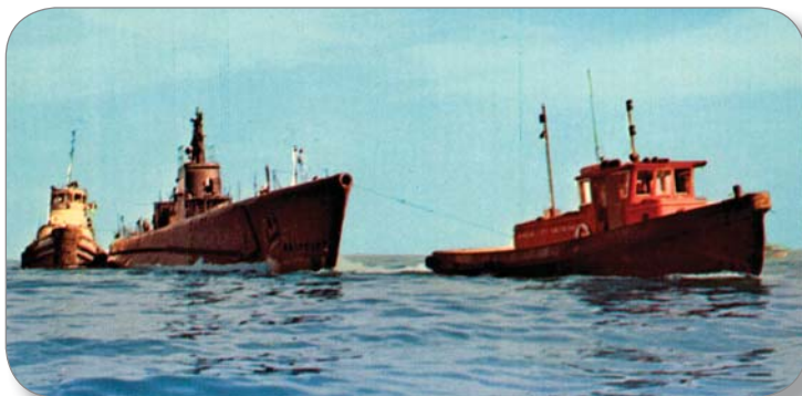
USS Cobia towed into Manitowoc in 1970 to become a local treasure.