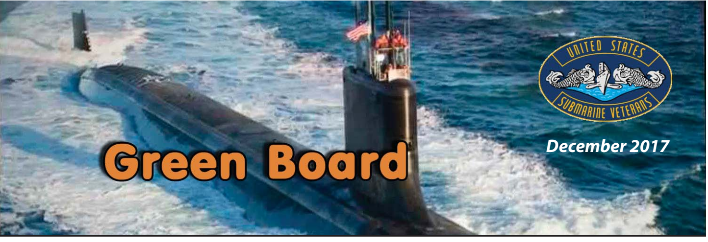
Publication for members of USS Illinois Base, United States Submarine Veterans, Inc.