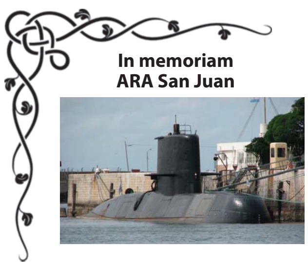
(Editor's Note: USSVI received the below article from the International Submariners Association and thought you might like to see it.)