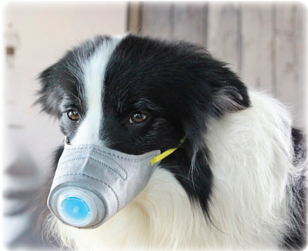
Dog gonna . . . I have to wear a mask too?