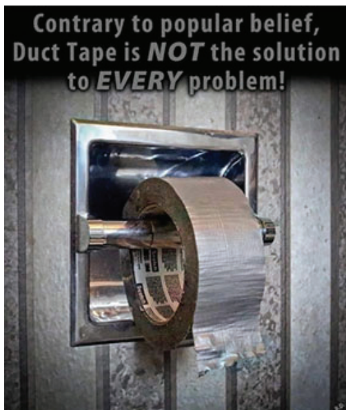
Maybe, Maybe not?

Share this information with all your friends and family members. They are looking for all skills--but, most importantly, people who have a love for submarines.