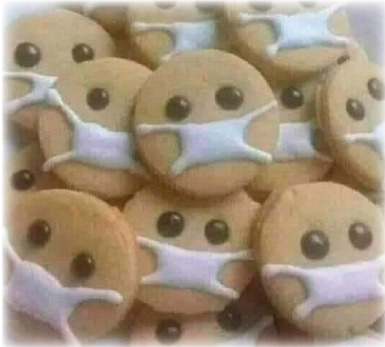
Now, here's the masks you can enjoy!