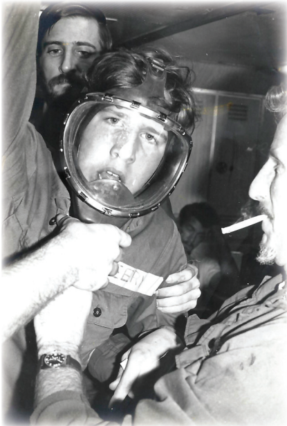
The original COVID Mask -- submarine style. Look familiar?