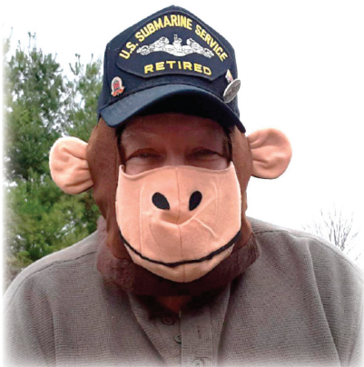
Give a Sub Sailor a simple task, and he'll find a way to screw it up.