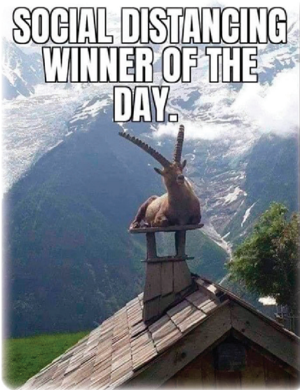
Need I say more?