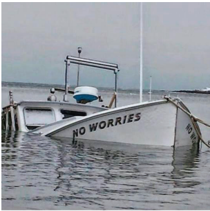
Think twice before naming your boat!

USNINEWS – Some observers have perceived a breakdown in the rules for naming Navy ships, it was reported. “Section 370 of the FY2021 NDAA (R.R. 6395/P.L. 116-283 of Jan. 1, 2021) established a commission regarding the removal and renaming of certain DOD assets (including ships).”