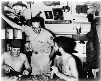
A War Correspondent chatting with crewmen in the Bullhead's (SS-332) galley, during a Pacific war patrol, circa Spring 1945.