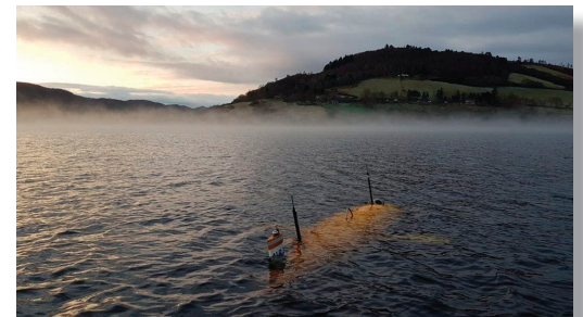
The National Oceanography Centre (NOC) started the tests in May. The machines were launched into the loch from near Drumnadrochit. Some of its robot submarines have been controlled from the centre’s office in Southampton on England’s south coast.

Editor’s Note: We American’s really know the reason . . . don’t we! We know they are looking for proof of “Nessie” the Loch Ness Monster. Remember, if she is sighted, you read it here first!